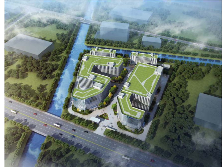
Nanxiang Production Site picture