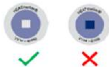
Combined Vaccine vial Monitor (VVM) and Threshold Indicator (TI)

Note: Innovation pictures are just examples of innovations