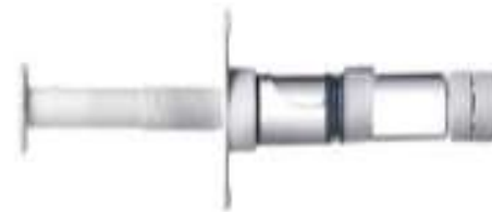
Dual-chamber delivery devices