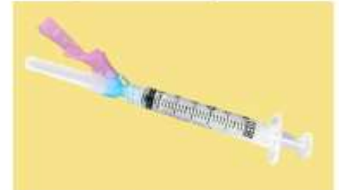
AD sharps-injury protection (SIP) syringes