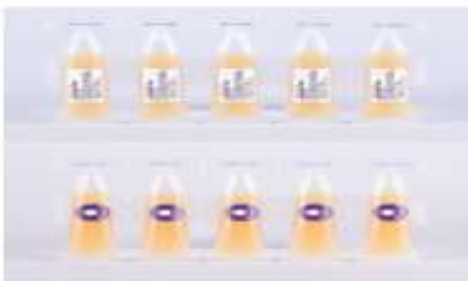
Heat stable/controlled temperature chain (CTC) qualified liquid formulations