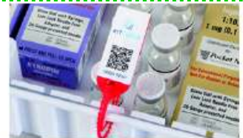
Barcodes / Radio Frequency Identification (RFID)

Note: Innovation pictures are just examples of innovations