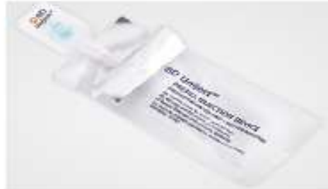
Compact prefilled auto-disable devices (CPADs)