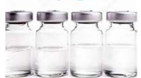
Freeze damage resistant liquid formulations