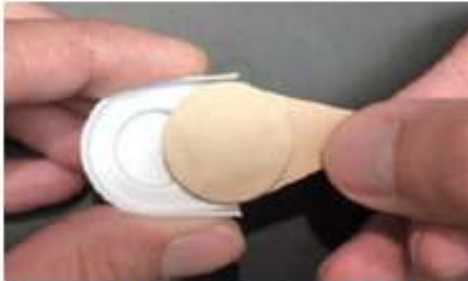
Microarray patches (MAPs)