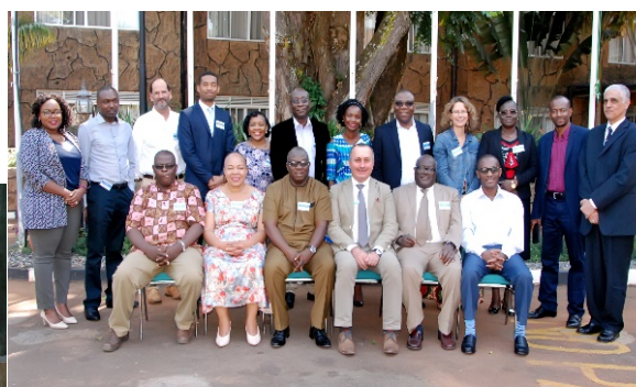
5 TH MEETING OF THE TECHNICAL COORDINATING COMMITTEE AND STEERING COMMITTEE OF THE AFRICAN VACCINE REGULATORY FORUM (AVAREF) ENTEBBE-UGANDA 24 TH - 28 TH SEPTEMBER, 2018