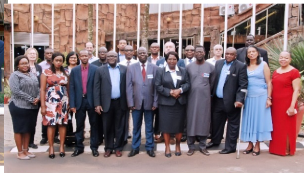
5 TH MEETING OF STEERING COMMITTEE OF THE AFRICAN VACCINE REGULATORY FORUM (AVAREF) ENTEBBE-UGANDA 24 TH - 28 TH SEPTEMBER, 2018