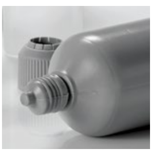
The KME closure is complemented by a screw cap with a mandrel. Screwing the mandrel in creates an opening through which the product can be dripped or squeezed out.