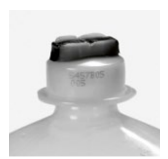
With the eurohead closure , the hermetically sealed container is combined with the eurohead cap. It was specifically designed to meet the requirements of infusion bottles (IV bottles).