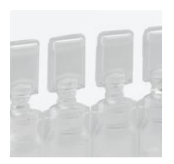
The twist-off cap is a closure design that has proven its worth millions of times and is used in a large number of production

When it comes to deciding on the right tamper-evident seal for you, it essentially comes down to how the product will be used and whether it's for single or repeated use. But the one thing they all have in common is the fact that every container is hermetically sealed to create a fully functional closure for a clean, convenient, and practical result.