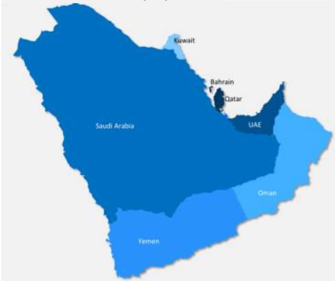
GULF COOPERATION COUNCIL (GCC) COUNTRIES