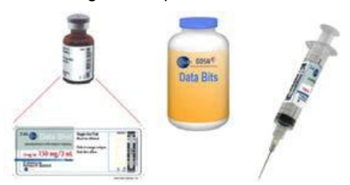
Figure 1.1 Primary Package examples:

Note: Identification of Primary Packaging is out-of-scope for this WHO recommendation and shown for definition & illustration purposes only.